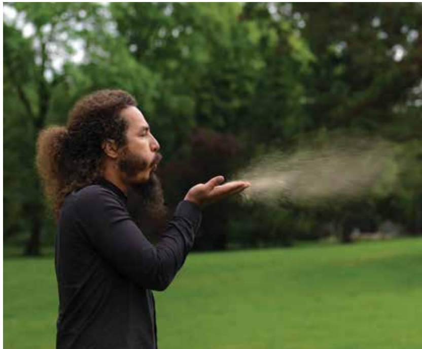
Reynier Leyva Novo | 2016, "My Mother Is The Rest Of The World"